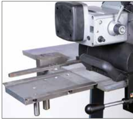
Inlet/outlet rails of the AutoCUT 500