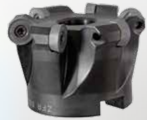
ZFR 500 arbor milling cutter accessories