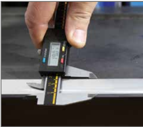
Chamfer width up to 30 mm